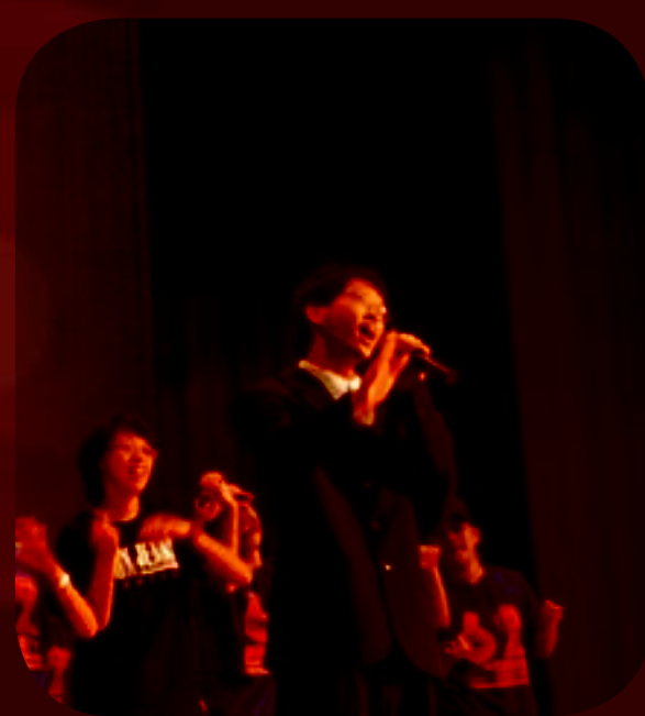
Class Photographs 班级合照